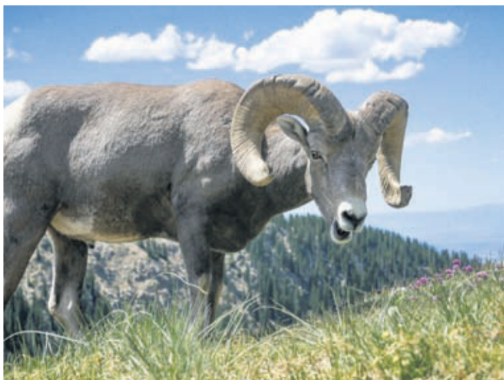
A Rocky Mountain bighorn sheep grazes atop Penitente Peak in the Pecos Wilderness near Santa Fe, N.M., July 4, 2019.

Male argali sheep can top 300 pounds with horns up to 5 feet long, making them prized among some hunters. In 2019, Schubarth paid $400 to a hunting guide for testicles from a trophy-sized Rocky Mountain bighorn sheep that had been killed in Montana. Schubarth extracted the semen from the testicles and used it to breed large bighorn sheep and sheep crossbred with the argali species, the documents show. □